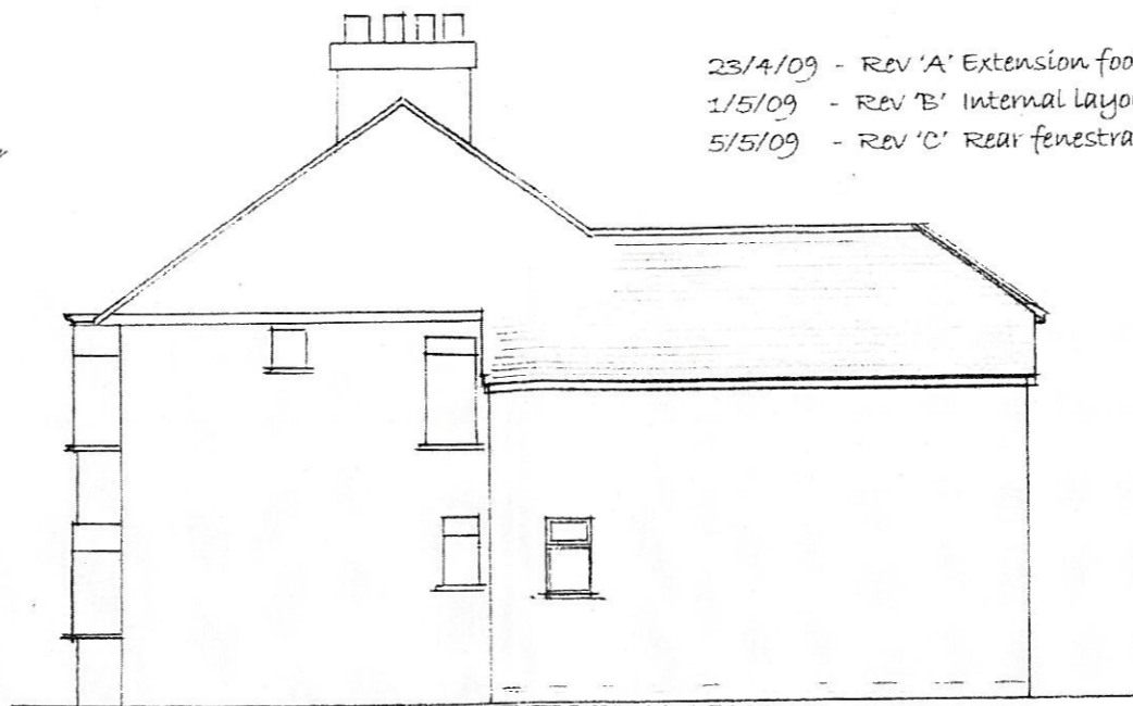
Proposed South East Elevation