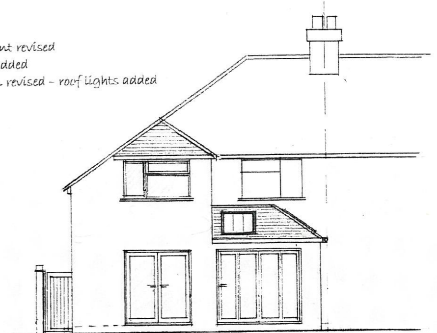
Proposed North East Elevation

23/4/09 - Rev 'A' Extension footprint revised 1/5/09 - Rev 'B' Internal layout added 5/5/09 - Rev 'C' Rear fenestration revised - roof lights added