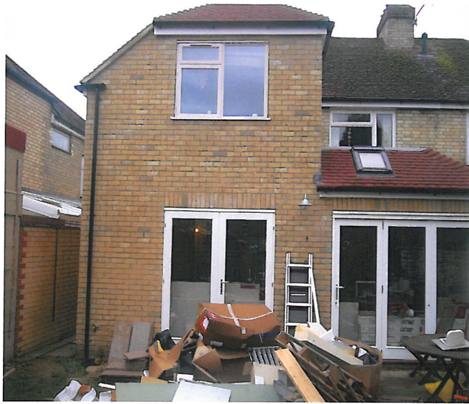
17 Hoadly Road