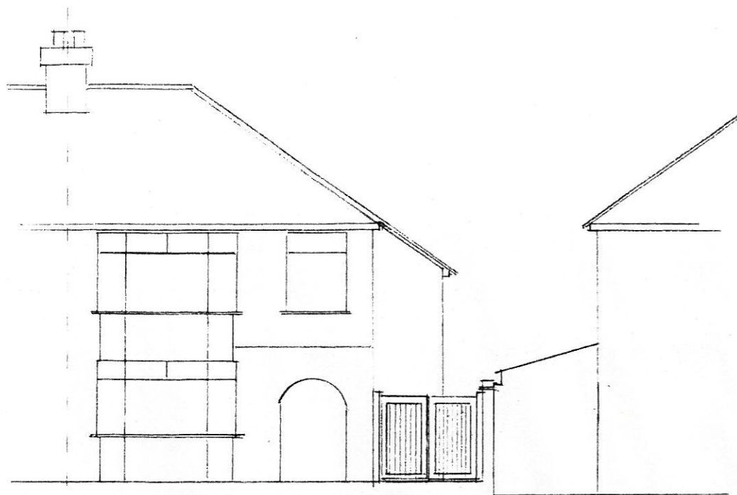
Proposed South West Elevation